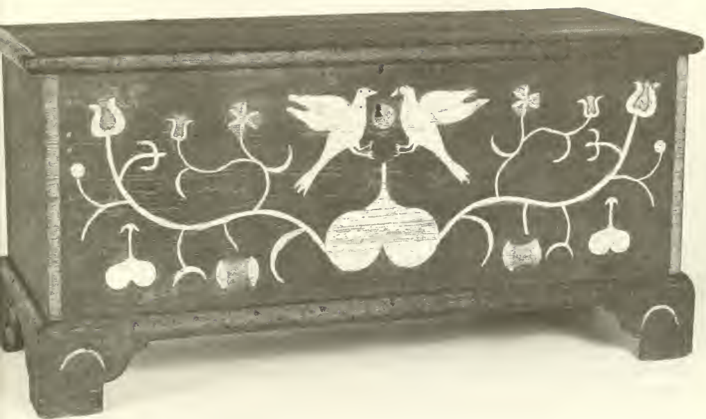
Chest by Johannes Spittler; yellow pine; Shenandoah Co., Va.; 1800–1810. HOA 32\frac{3}{4} " ; WOA 49\frac{1}{4} " ; DOA 21\frac{3}{4} ". Private collection.